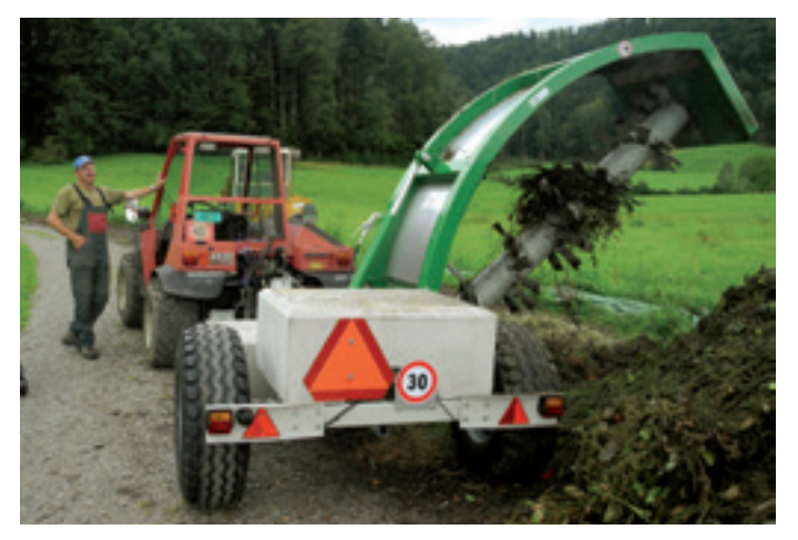
After operation the tunnel can be conveniently placed in the transport position.