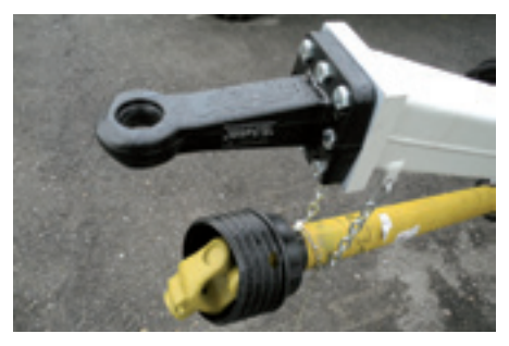
Standard trailer hitch front: DIN coupling