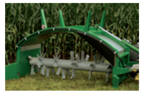
The solid arch construction made of 6 mm steel ensures a very high stability.