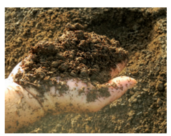
Horse manure after 5 weeks.