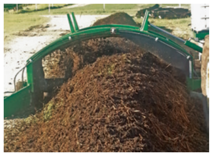
With the TG 231 a successful composting is achieved easily and quickly. This is due largely to the turning axis that works perfectly and that moves the material from the inside to the outside.