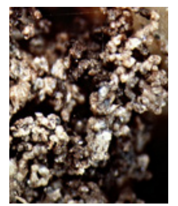
Perfect crumb structure - microscopic view

The temperature must not rise above 65°C and humidity must be between 50 and 60%. Additional information is available from the composting courses of Urs Hildebrandt: www.landmanagement.net.