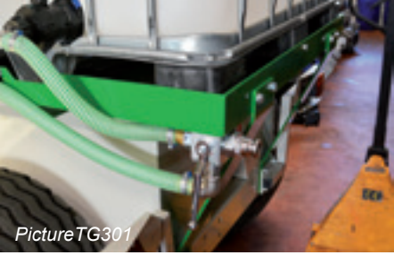
External water intake possibility for external water sources