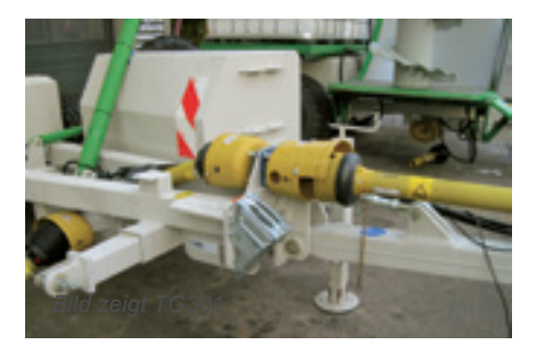
Down-hitch for deep pull