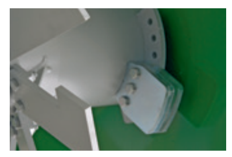
12 mm shaft width with 3 fixed screws. The balanced axle ensures long life.