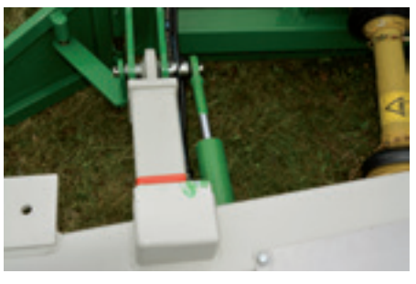
Hydraulic tilting system of the tunnel, so that the battery stays in the site where it belongs.