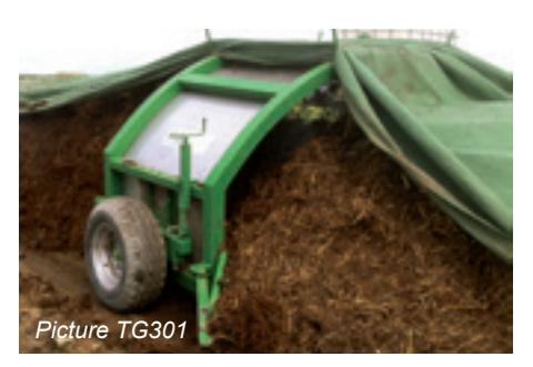
The fabric cover is joined to a smaller width to allow gases to escape. The hard manual work involving the wet fabric is avoided.